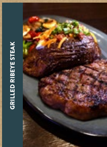
GRILLED RIBEYE STEAK