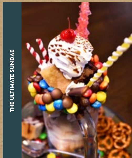
THE ULTIMATE SUNDAE