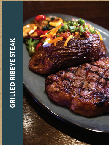
GRILLED RIBEYE STEAK