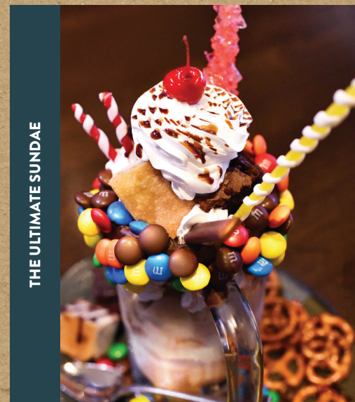
THE ULTIMATE SUNDAE