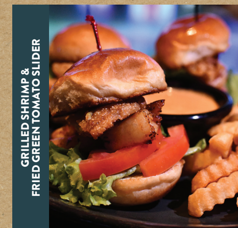
GRILLED SHRIMP & FRIED GREEN TOMATO SLIDER